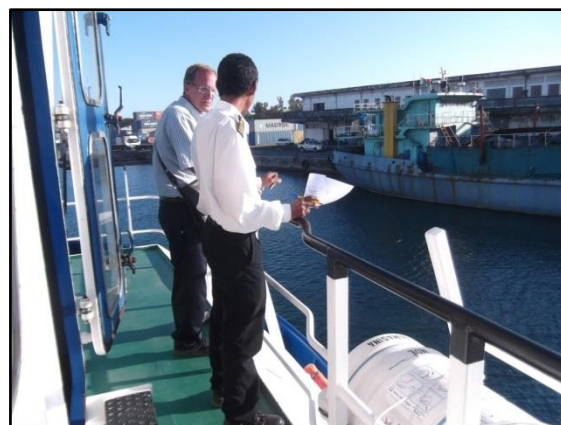
With Harbor Master at the Port of Toamasina, Assessment - Madagascar 2014