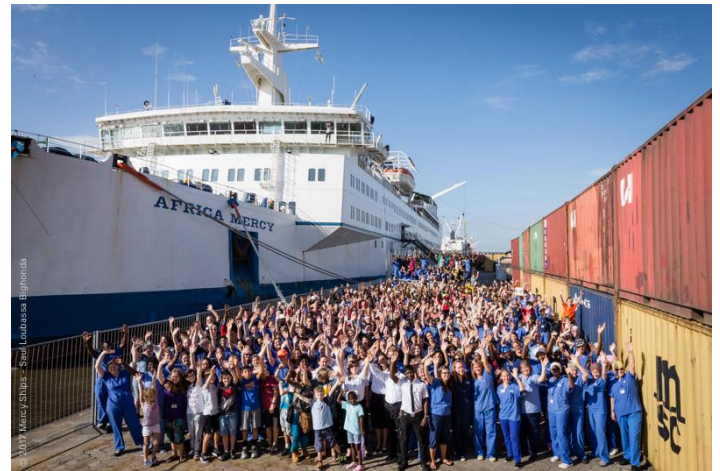
Some of the crew of the Africa Mercy

“If there is any encouragement in Christ, any solace in love, any participation in the Spirit, any compassion and mercy, complete my joy by being of the same mind, with the same love, united in heart, thinking one thing. Do nothing out of selfishness or out of vainglory; rather, humbly regard others as more important than yourselves, each looking out not for his own interests, but also everyone for those of others. Have among yourselves the same attitude that is also yours in Christ Jesus . . .” Philippians 2:1-5