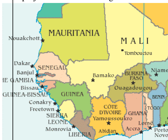
Photo: Benin is in the lower right corner of this map – to the east is Nigeria and to the west is Togo.

Please pray *Our advance team in Benin preparing the way *Safety for everyone during the technical phase of the ship *For the right day crew to join us in Benin *For the patients and healthcare education participants from in and around Benin