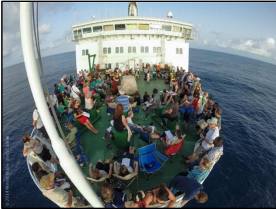
Photo: Worship on the bow of the Africa Mercy while sailing – amazing time to worship our Great God.

the next season and for us that is technical and the field service to Benin. I am thankful for the time of transition.