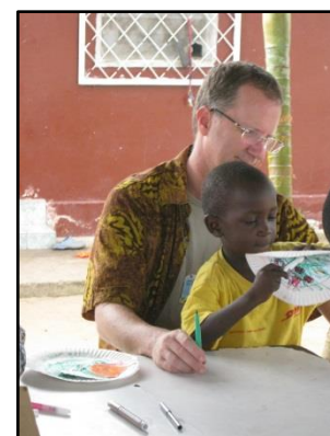
Photo: Craft time at Ngoyo Plains Orphanage – story on Jesus calming the storm.

Last Saturday was our final Mercy Ministries visit – I joined the team at Ngoyo Plains Orphanage with the children and teens there (see the photo). Our Jesus Film team shared the film based on the gospel of Luke and the discipleship videos in partnership with Navigators with over 2,800 people in Pointe-Noire – over 600 expressed a commitment or asked for prayer. In total Mercy Ministries conducted 349 site visits with about 100 crew members every week participating.